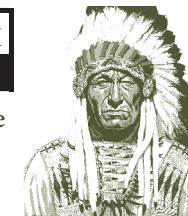
on view year round